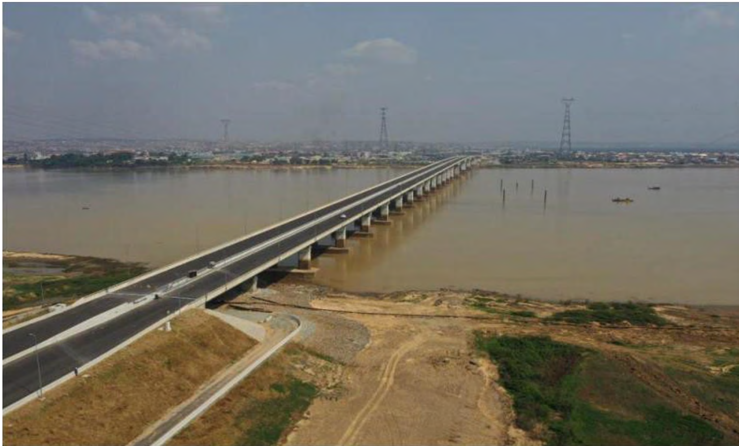
The Second Niger Bridge

Notably, Pan Services is valued member of the consortium responsible for monitoring the deployment of these funds, ensuring accountability in the construction of these vital infrastructure projects.